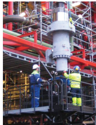
Technology Advantage Web Portal

Bulletin FSG-SS-011a (E) Printed in USA. February 2012. © Flowserve Corporation