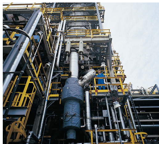
Type PR Reactor Recycle Pump Installation

Left undetected, these problems can result in decreased efficiencies, damaged equipment and the loss of millions of dollars in costly downtime.