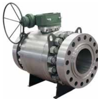
Flowserve Valbart VB3 side-entry, trunnion-mounted ball valve