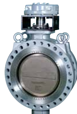
Flowserve TX triple-offset, high-performance butterfly valve