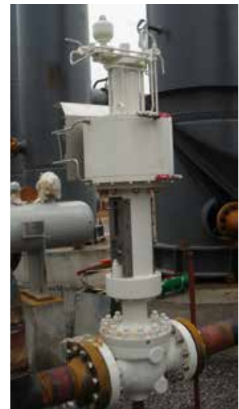
RSBV installed in Molecular Sieve Service

In summary, great care should be exercised in the selection and specification of molecular sieve unit switching valves. Valve type, sealing dynamics, materials of construction, actuation and controls are all essential issues requiring intense scrutiny. Request documentation — installation/application lists, customer testimonials, performance/service proof — from prospective suppliers to assist you in the RFP evaluation process. In doing so, you will significantly enhance your ability to achieve your unit's operational and financial performance goals.