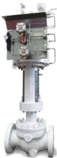
Flowserve Valbart™ Rising Stem Ball Valve (RSBV)

For most molecular sieve unit operators, the preferred switching valve type continues to be the purposefully engineered rising stem ball valve (RSBV) with its friction-free linear movement and mechanically energized metal seat. Its time-tested service record has proven it to be the only suitable design for optimal long-term performance in severe applications, delivering unequalled reliability and availability. Of the three valve types, the RSBV is best at satisfying the competing priorities of cost versus performance.