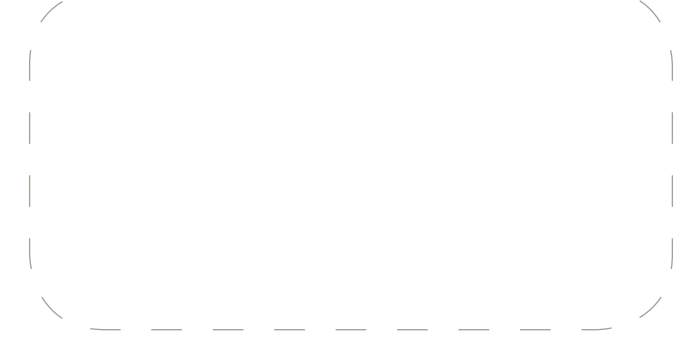
FCD KMENBR5000-01-A4 02/15

All data subject to change without notice. © 11.2008 Flowserve Corporation. Flowserve and Valtek are trademarks of Flowserve Corporation