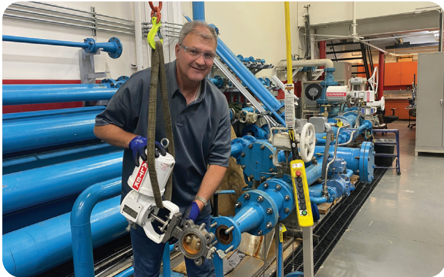
Flowserve engineers conducted numerous hours of cycle testing on the new high-cycle soft seat arrangement before finalizing the design.