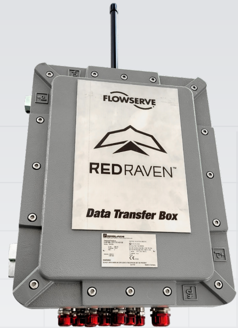
DTB Ex d