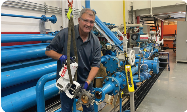
Flowserve engineers conducted numerous hours of cycle testing on the new high-cycle soft seat arrangement before finalizing the design.