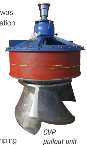
CVP pullout unit

To support the DNA project, Flowserve provided six CVP axial flow concrete volute pumps, capable of delivering 846,000 m 3 /h (141,012 m 3 /h per pump) — nearly six Olympic-sized swimming pools per minute.