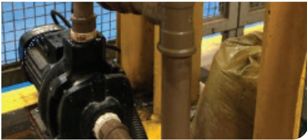
An automated system delivers reclaimed water to the wash cabin.

With these changes in place, all water now flows to the water treatment station and then to the main water tower, completing the closed-loop cycle.