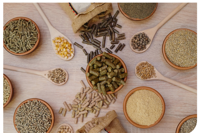
Protein-rich feed produced in a fermentation process instead of conventional agricultural methods will be used for fish (aquaculture), livestock feed, pet food and other needs.

The transition to more sustainable production of animal feed does not require agricultural land, does not include plant or animal components, and uses relatively little water. Instead, it is produced through the fermentation of naturally occurring micro-organisms. The resulting food product has been shown to be safe and effectively sustain growth rates for livestock, fish, pets and other animal needs.