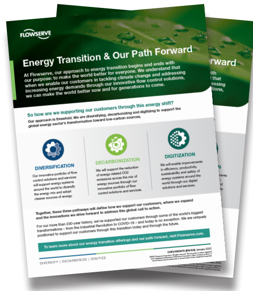
Read Flowserve's approach to energy transition .

We can leverage our 225 years of flow control experience and a comprehensive portfolio of product and service solutions so our customers can diversify their energy mix, decarbonize their operations, and digitize their plant processes. As a partner, Flowserve enables companies to increase operational efficiency and achieve energy transition goals. And, in this case, meet critical needs to enhance agricultural sustainability.