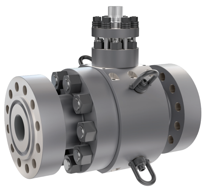
Argus FK75F metal-seated floating ball valve